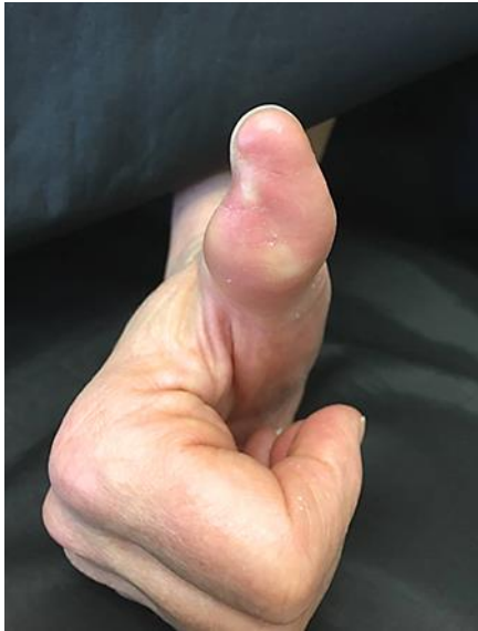
Fig. 3. Right thumb after 6 months of itraconazole treatment 100 mg twice daily. Note the loss of substance to the fingertip.