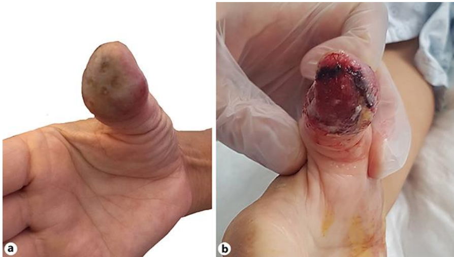
Fig. 1. a Initial cutaneous necrosis of the right thumb of a 60-year-old woman. b Two days after hospitalization and after surgical debridement of the necrotic parts of the right thumb.